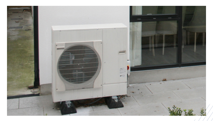
Figure 2: Air Source Heat Pump Outdoor Unit

Ground Source and Water Source: Ground source and water source heat pump systems are less common than air source units. A ground source heat pump system, also known as a geothermal heat pump system, uses the earth as a source of renewable heat. Heat is drawn from the ground through collector pipework and transferred to the heat pump. The ground collector can be laid out horizontally at a shallow depth below the surface or else vertically to a greater depth.